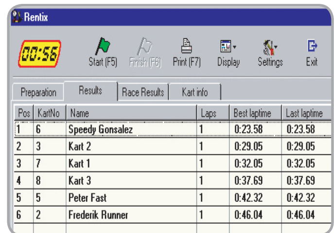
Results Screens in Best Lap Times or in Race Results